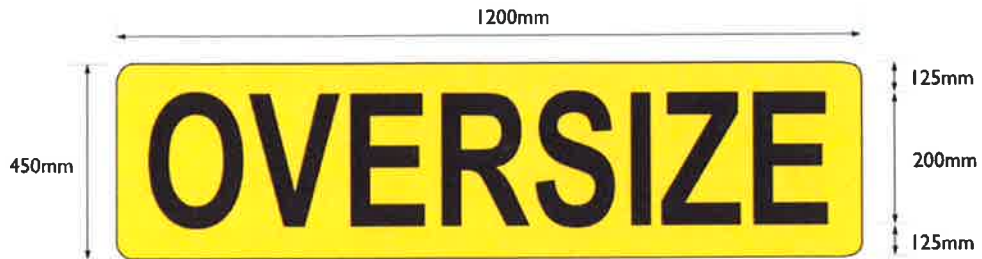
Diagram 4: example of OVERSIZE vehicle sign

Surface area of plate must be at least 0.540m 2