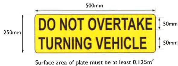
Diagram 3: example of DO NOT OVERTAKE TURNING VEHICLE SIGN